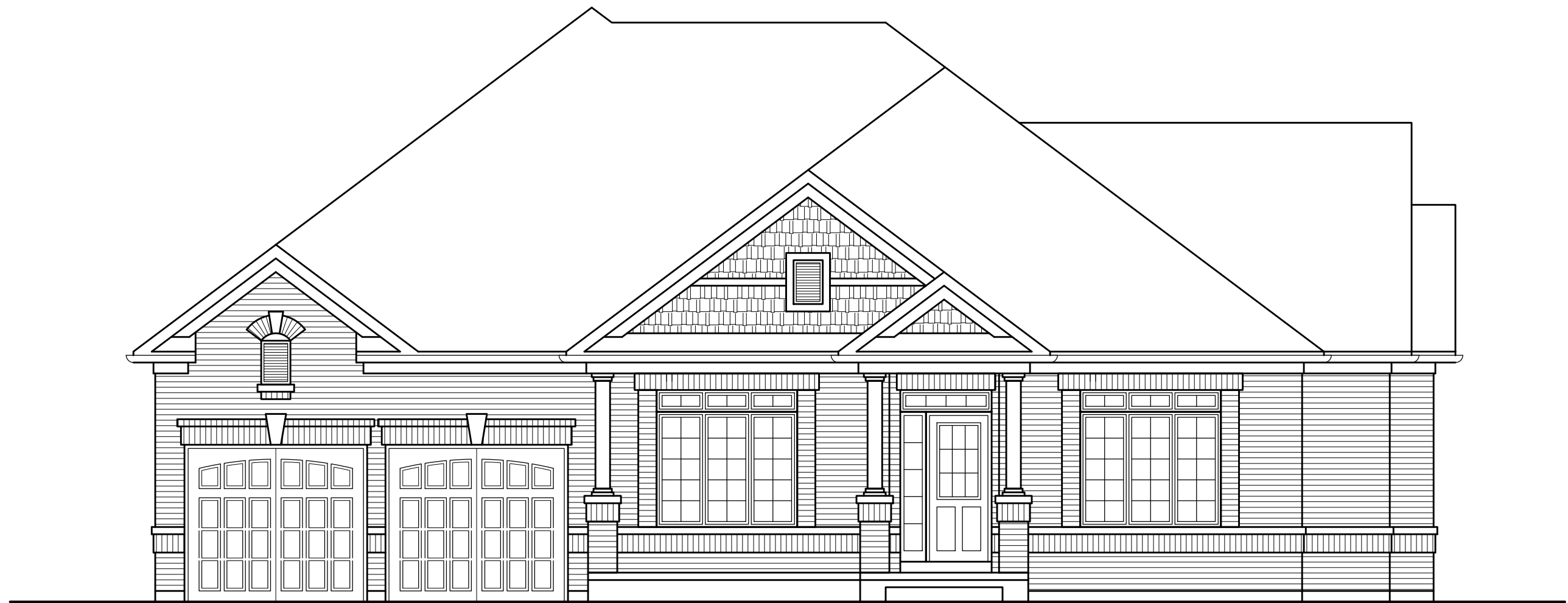
FRONT ELEVATION 'A'